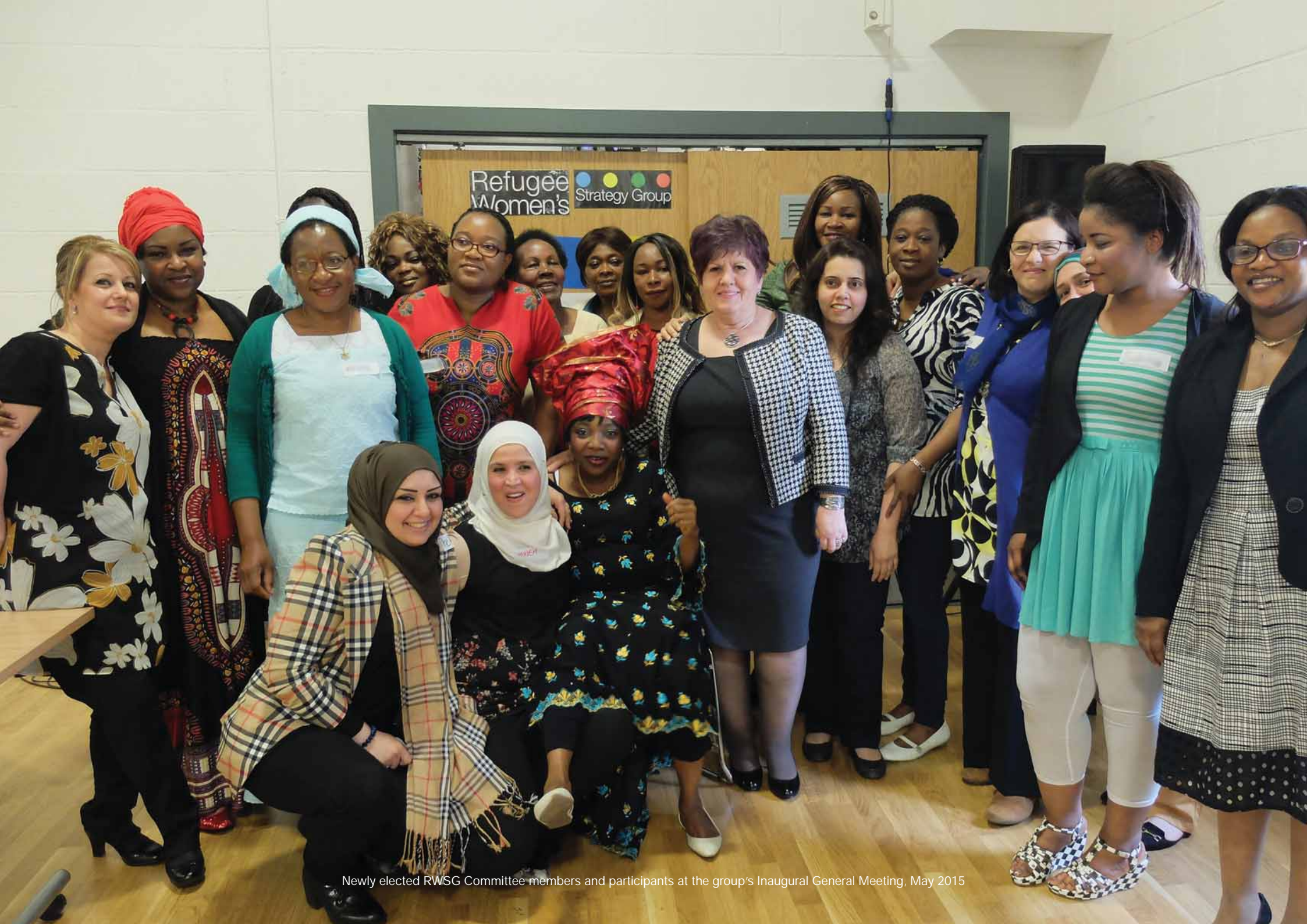
Newly elected RWSG Committee members and participants at the group's Inaugural General Meeting, May 2015