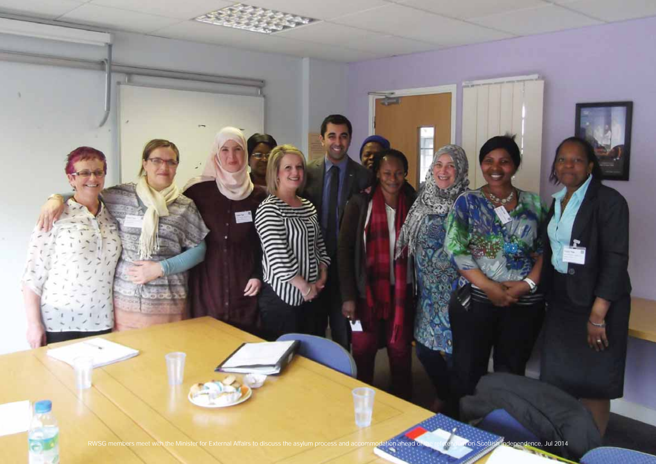
RWSG members meet with the Minister for External Affairs to discuss the asylum process and accommodation ahead of the referendum on Scottish independence, Jul 2014