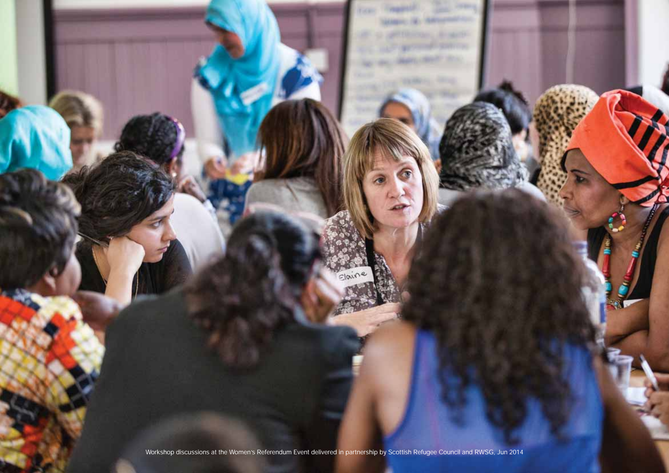
Workshop discussions at the Women's Referendum Event delivered in partnership by Scottish Refugee Council and RWSG, Jun 2014