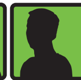
Shaqaalaha Bulshada (Social Worker)