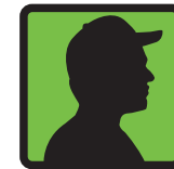
Shaqale muhiim ah