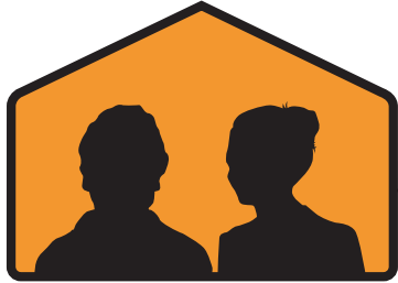
Waalid (waalidiin) sida waalidkaa oo kale ah

Xanaanada Sida tan waalidkaa oo kale ah (Foster Care)