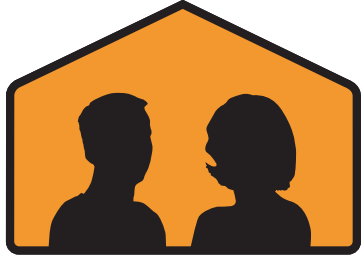
Xanaanada (xanaanooyinka) Taageerda wata

Xanaanada Taageerada wadata (Supported Care)