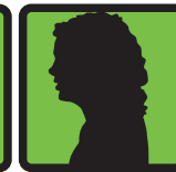
Maamulaha Xilliga hawshu socoto (Duty Manager)