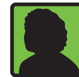
Hogaamiyaha Kooxda Hawsha wada (Practice Team Leader)