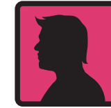
Sarkaalka Xaquuqda Caruurta