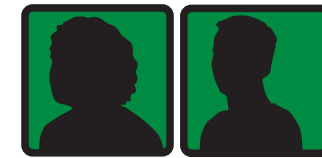
Practice Team Leader